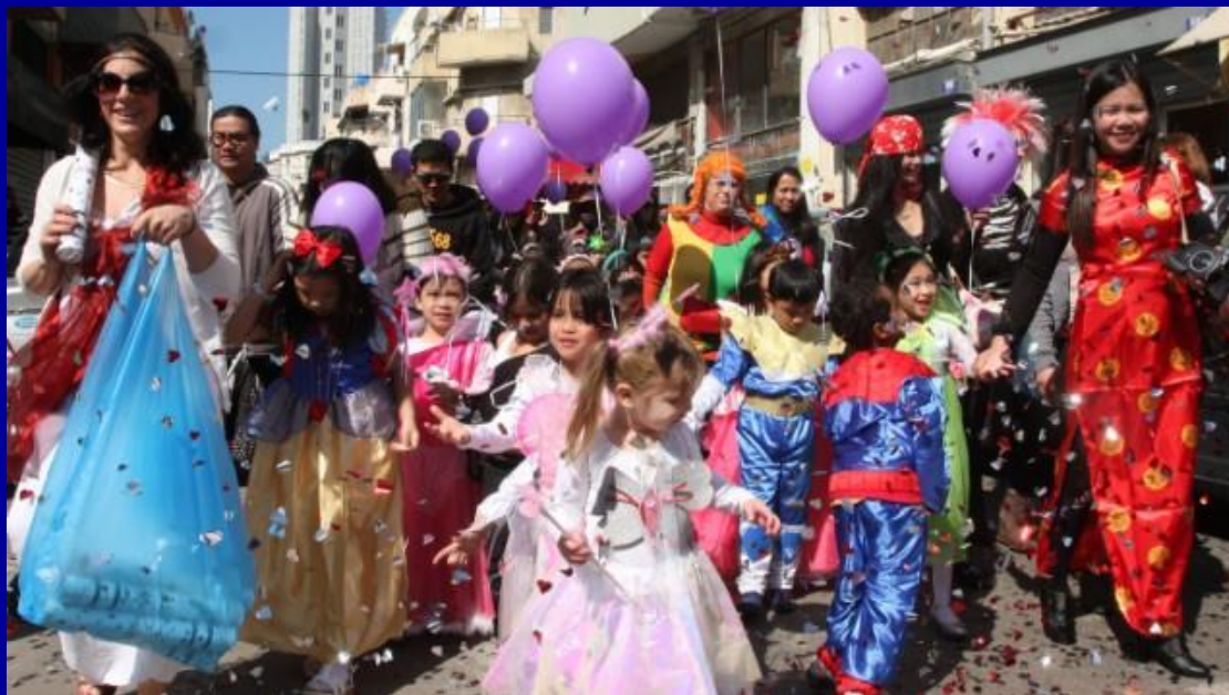
Children and Adults celebrating Purim

Purim is sometimes criticized as being a “ Jewish Halloween or Carnival. ” This is because, it is a tradition that people; especially the children in Jewish families dress up in costumes and wear masks for this joyful Festival. Additionally, this is the season when Jewish men are encouraged to liberally consume alcoholic drinks. However, they are forbidden to drink to the point at which they may lose the ability to discern good from evil. I intend to show ample evidence that those criticisms of the Purim Festival are wholly unfounded.