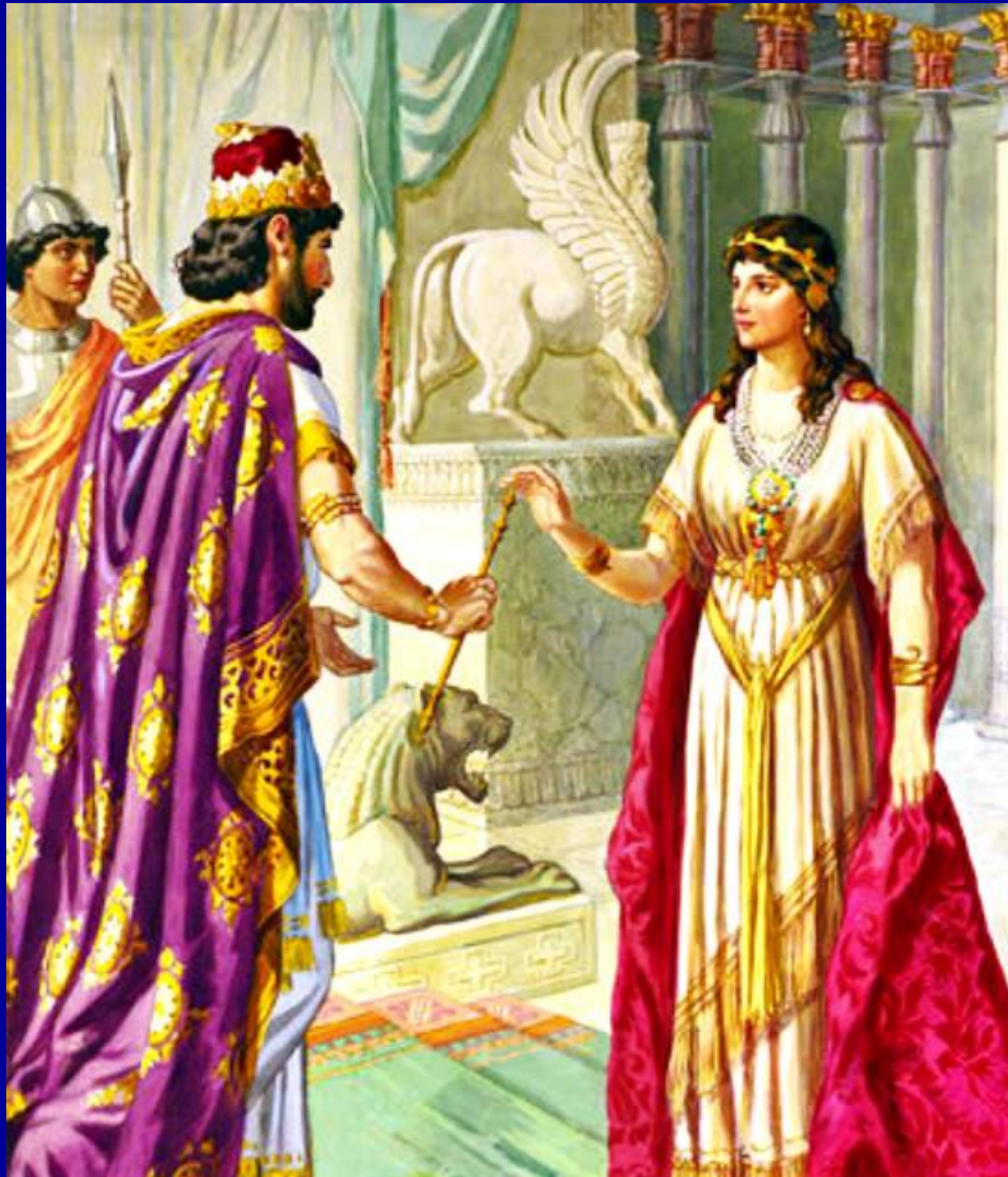
King Ahaspherous with Queen Esther

Mordecai symbolises a type of Mashiach ben Yosef . Who according to Jewish Sages' interpretation is mandated to re-identify and return the Lost House of Israel (Ten Tribes) to their heritage. (Kol Ha Tor, Gaon of Vilna, Rabbi Hillel Shkover). He saved the orphan Esther and he took her in and looked after her, and it was he who led her to the King.