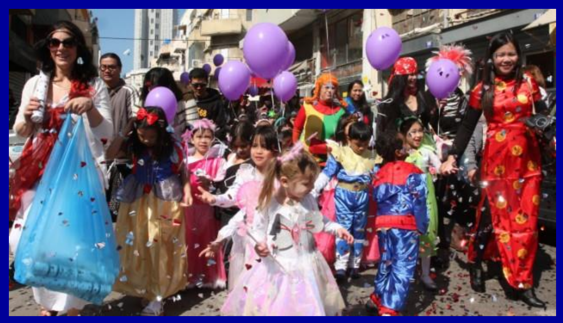
Children and Adults celebrating Purim

Purim is sometimes criticized as being a "Jewish Halloween or Carnival." This is because, it is a tradition that people; especially the children in Jewish families dress up in costumes and wear masks for this joyful Festival. Additionally, this is the season when Jewish men are encouraged to liberally consume alcoholic drinks. However, they are forbidden to drink to the point at which they may lose the ability to discern good from evil. I intend to show ample evidence that those criticisms of the Purim Festival are wholly unfounded.